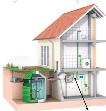
Cuadro de Control