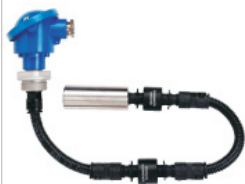
3 Level Sensor

Diesel tanks. Recovery of hydrocarbons. Light indicators. Equipped with a special sensor of 3 levels. Relay type alarm output. Acoustic warning. Minimum level alert and maximum level.